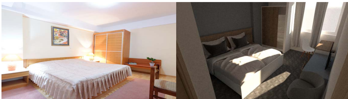
Rooms and apartments