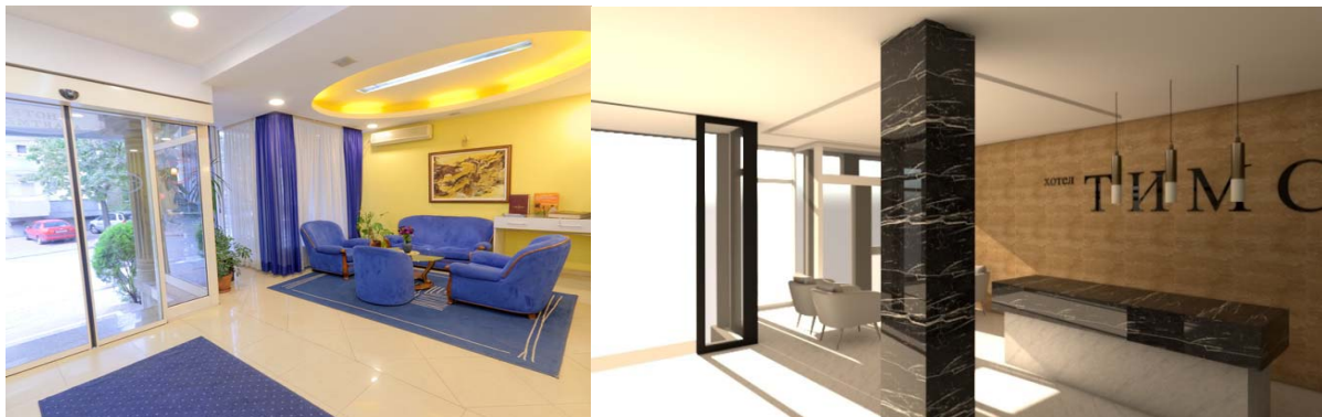
Lobby area – Furniture and carpentry

Examples that include improvement at the hotel: